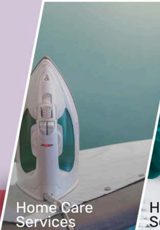
Home Care Services