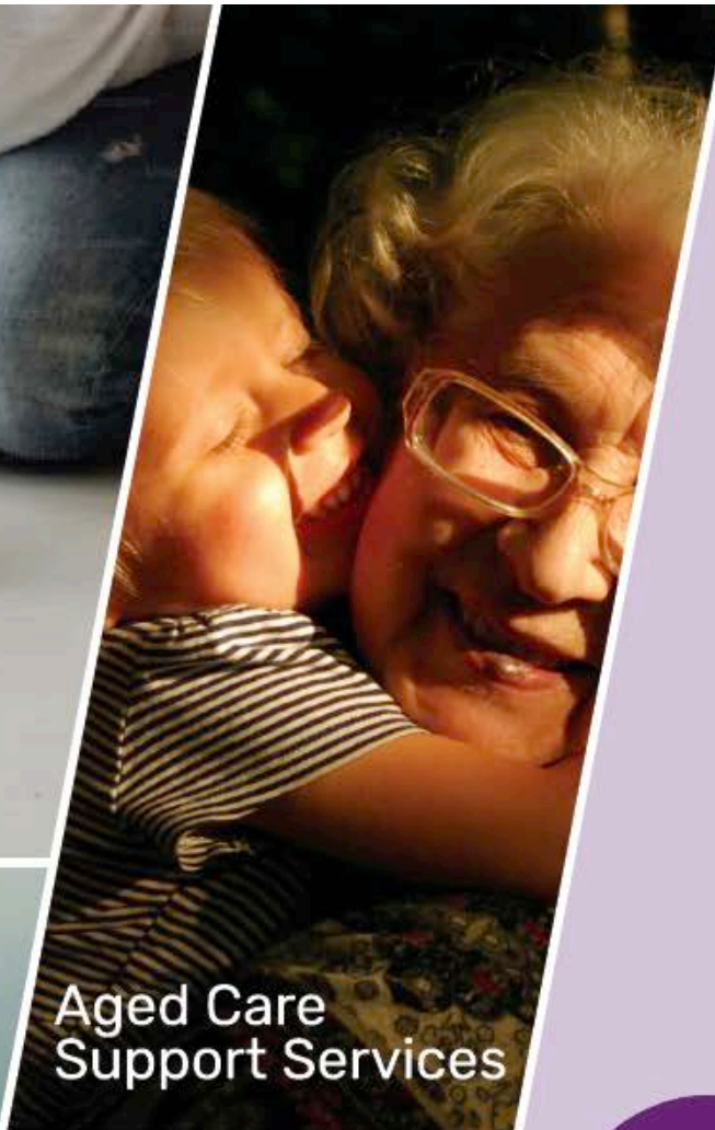
Aged Care Support Services